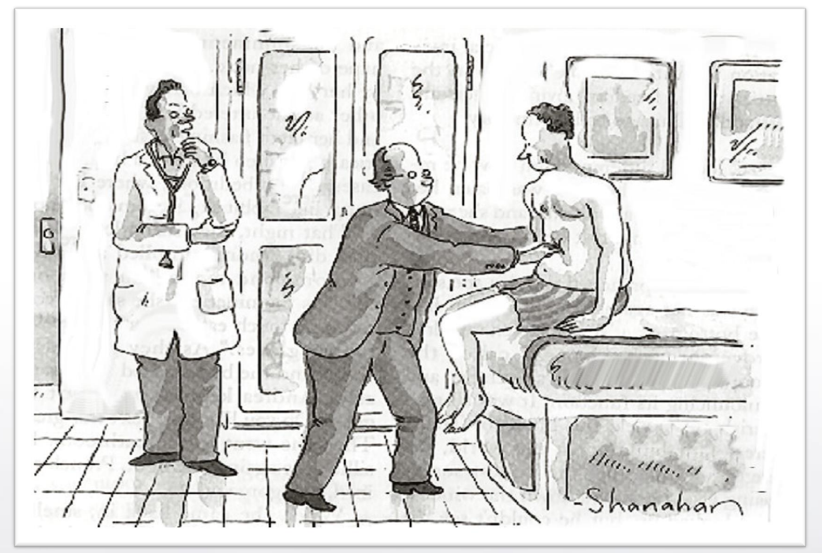
Does it hurt when my lawyer touches you there?